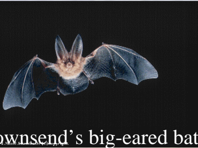
Townsend's big-eared bat

Currently recommend 29 species be covered by Plan: 14 wildlife species