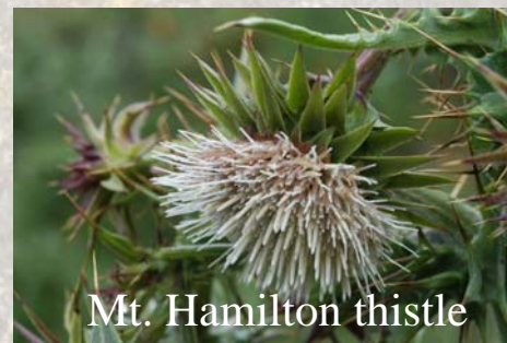
Mt. Hamilton thistle