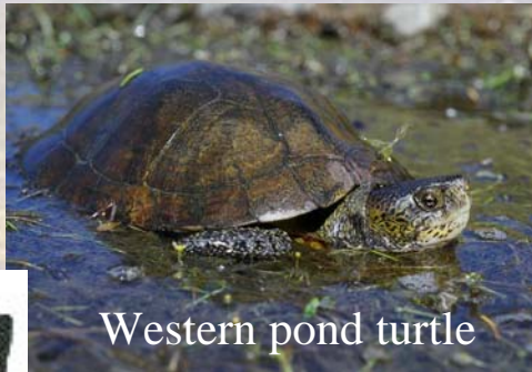
Western pond turtle