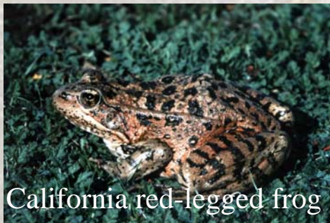
California red-legged frog