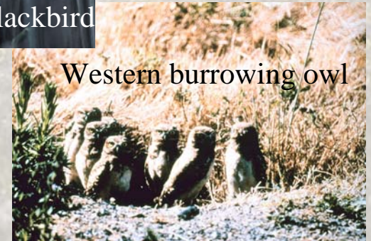
Western burrowing owl