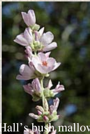
Hall's bush mallow