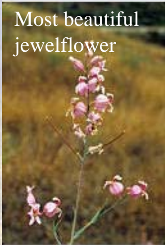
Most beautiful jewelflower