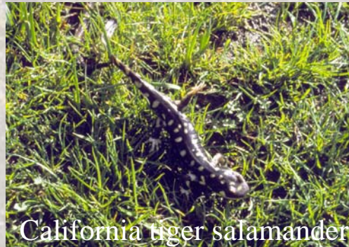
California tiger salamander