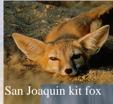
San Joaquin kit fox